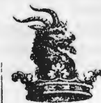
Crest of Lord Bagot