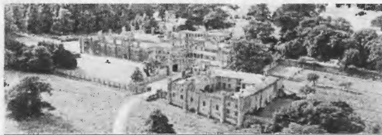
Blithfield – the main home of the Bagot family for 750 years.