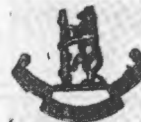
1st Volunteer Battalion Warwickshire Regiment